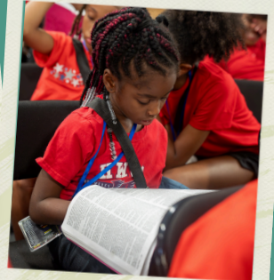
G.A.M.E Time God And Me Engaged